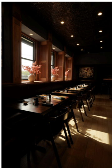
Cameron Burton, courtesy Namiro